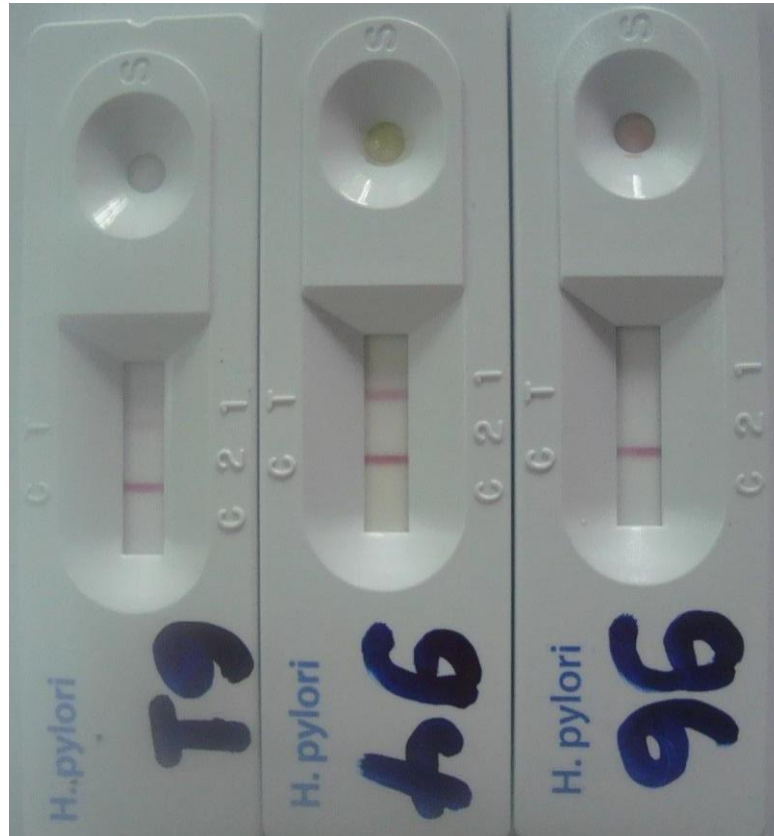
Figure 1. Photograph of SD BIOLINE H. pylori rapid antibody test results. Left: faint positive; Middle: Positive; Right: Negative (61, 94, and 96: Patients' identification numbers).